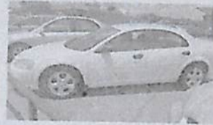
2004 Dodge Stratus Clean, Cold Air! Auto, 168K Miles, $3,695. Blue Ridge Automotive 3504 Blue Ridge Blvd. Walhalla, 864-638-2129