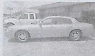
2007 LINCOLN TOWN CAR Local, Signature Series Extra Clean, 138K Miles-$6,995 Blue Ridge Automotive 3504 Blue Ridge Blvd. Walhalla 864-638-2129