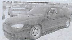
2004 PONTIAC GRAND AM V6, black w/ gray interior, Alloy wheels, cold AC, 130K miles- $3,250 Cash! Bountyland Used Cars 1110 Frontage Road, Seneca, 864-221-9949