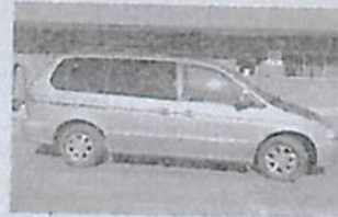
2004 Honda Odyssey Loaded! 118k $7,995. Seneca Auto Sales 542 W.N. First St. Seneca, SC Call 864-888-1100