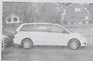
07 Toyota Sienna LE, 136K, $5,900. Pete's Auto 402 S. Oak St. • Seneca Call 882-1467