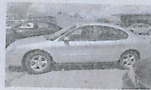
2003 Ford Taurus SE Auto, Air, 199K Miles, $2,995. Blue Ridge Automotive 3504 Blue Ridge Blvd. Walhalla, 864-638-2129