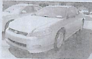
06 Chevrolet Monte Carlo 35K miles. $12,000 Pete's Auto 402 South Oak Street Seneca • 864-882-1467