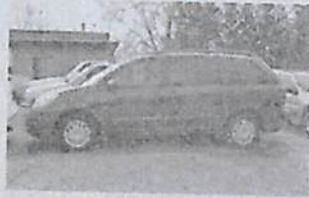
05 Toyota Sienna CE 113K miles. $5,500. Pete's Auto 402 S. Oak St. • Seneca Call 882-1467