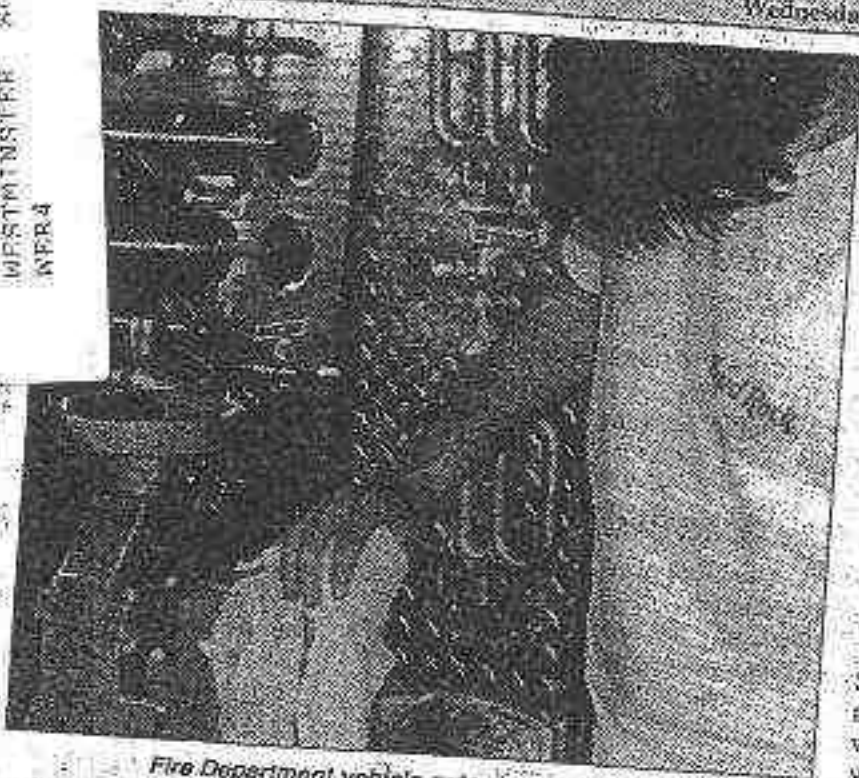
Fire Department vehicle gets a good cleaning.

...it food stamp recipients are automatically eligible. A photo ID is required by law. A valid driver's license, ID card, a second form of identification and current income for the household.