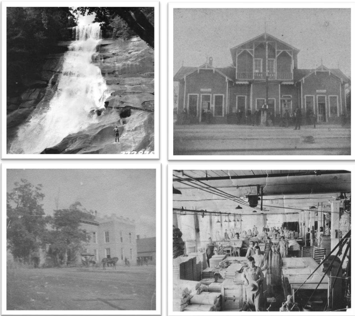
Top Left to Right: White Waterfalls, The Old Seneca Depot; Bottom Left to Right: The Old Jail and Kenneth Mill

Quality of life in Oconee County is excellent, as measured based on the social and economic environment provided by our freedoms, happiness, material well-being, environmental health, and community life factors. The citizens of Oconee County are committed to fostering economic growth while protecting the natural beauty of the County.