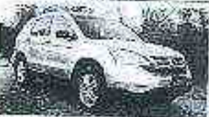
2011 HONDA CIVIC EX 109 K miles - $4,800 Bobby Wood Used Cars 101 S Highway 11 West Union 838-7845