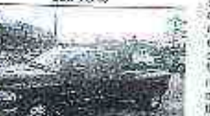
2013 CHEVROLET SPARK Automatic - 32K miles - $10,500 Bobby Wood Used Cars 101 S Highway 11 West Union 838-7845