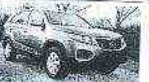
2011 KIA SORENTO 87K - $12,500 Bobby Wood Used Cars 101 S Highway 11 West Union 838-7845