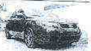
2011 KIA FORTE 80K miles - $9,995 Bobby Wood Used Cars 101 S Highway 11 West Union 838-7845