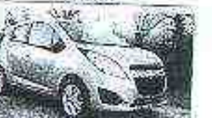
2013 CHEVROLET SPARK Automatic - 32K miles - $10,500 Bobby Wood Used Cars 101 S Highway 11 West Union 838-7845