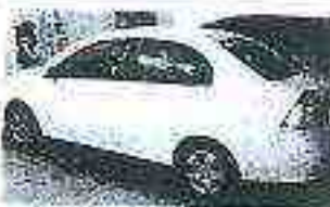
2010 CHEVROLET AVEO Automatic, air, new tires 49,000 miles - $5,800 Dorothy Wood Used Cars 1806 Blue Ridge Pkwy - Seneca 825-8945