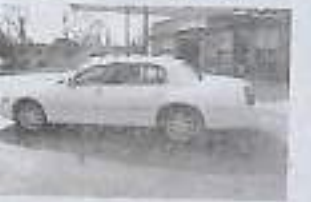
07 Lincoln Signature Limited, 45K, $7,500. Pete's Auto 402 S. Oak Street Seneca • 864-882-1467