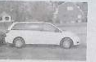
07 Toyota Sienna LE, 136K, $5,900. Pete's Auto 402 S. Oak St. • Seneca Call 882-1467