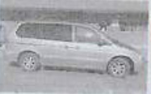
2004 Honda Odyssey Loaded! 118k $7,995. Seneca Auto Sales 542 W.N. First St. Seneca, SC Call 864-888-1100