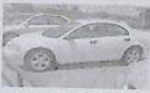
2004 Dodge Stratus Clean, Cold Air! Auto, 166K Miles, $3,695. Blue Ridge Automotive 3504 Blue Ridge Blvd. Walhalla, 864-638-2129