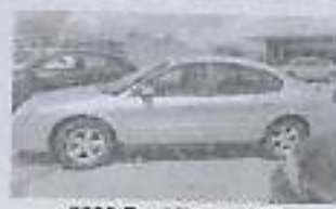
2003 Ford Taurus SE Auto, Air, 199K Miles, $2,985. Blue Ridge Automotive 3504 Blue Ridge Blvd. Walhalla, 864-638-2129