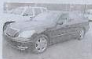
04 LEXUS LS430 147k miles, Reduced..$8,500. Pete's Auto 402 S. Oak St. Seneca • 864-882-1467