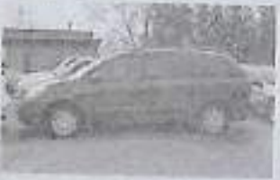
05 Toyota Sienna CE 113K miles. $5,500. Pete's Auto 402 S. Oak St. • Seneca Call 862-1467