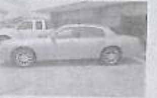
2007 LINCOLN TOWN CAR Local, Signature Series Extra Clean, 138K Miles-$6,995 Blue Ridge Automotive 3504 Blue Ridge Blvd. Walhalla 864-638-2129