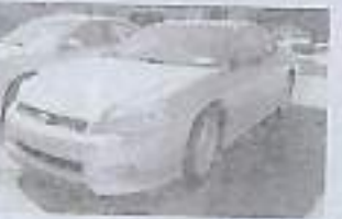
06 Chevrolet Monte Carlo 35K miles $12,000 Pete's Auto 402 South Oak Street Seneca • 864-882-1467