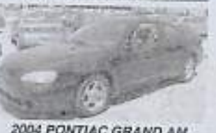
2004 PONTIAC GRAND AM V6, black w/ gray interior, Alloy wheels, cold AC, 130K miles- $3,250 Cash! Bountyland Used Cars 1110 Frontage Road, Seneca, 864-221-9949