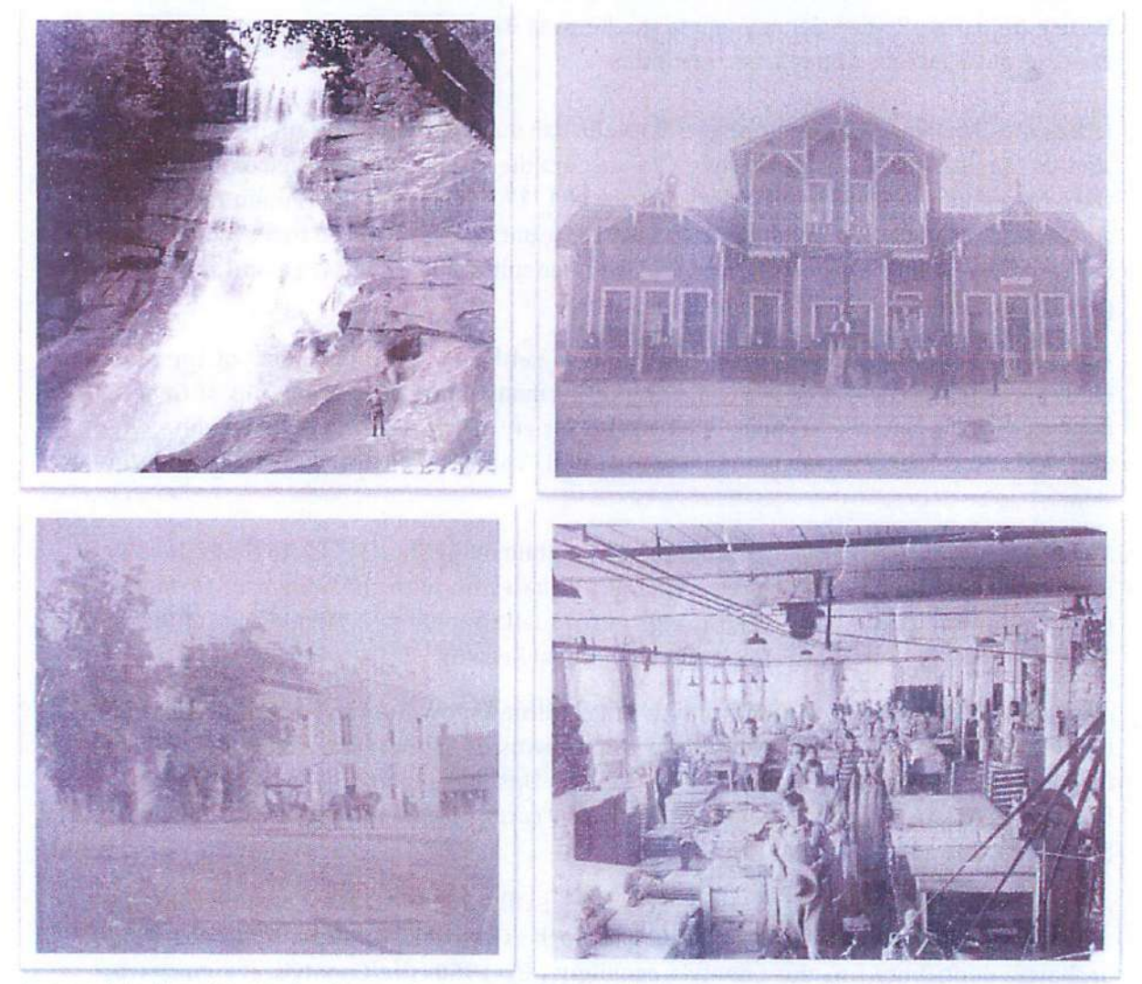
fou Left to Right, White Waterfalls, The Old Seneca Debot, Bottom Left to Right, The Old Jail and Kenneth Mill

Quality of life in Oconee County is excellent, as measured based on the social and economic environment provided by our freedoms, happiness, material well-being, environmental health, and community life factors. The citizens of Oconee County are committed to fostering economic growth while protecting the natural beauty of the County.