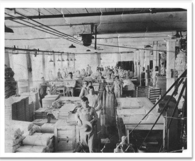
Top Left to Right: White Waterfalls, The Old Seneca Depot; Bottom Left to Right: The Old Jail and Kenneth Mill