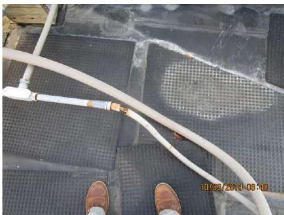
Law Enforcement Bldg..