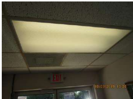
Lighting Brown Bldg.