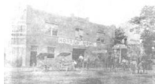
On this date... March 29, 2018

Seneca FFA placed 15th out of 343 chapters in the state, earning a Top Chapter Award at the 90th Missouri FFA