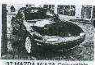
97 MAZDA MIATA Convertible 170K Miles - $4,000 Pete's Auto 402 Oak St. - Seneca 892-1467