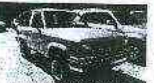
89 FORD BRONCO II XLT 4WD 177k miles - $5,500 Pete's Auto 402 S. Oak St. - Seneca 862-1467