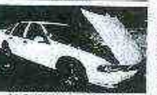
83 CHEVROLET CAPRICE "Customized" 180k miles - $5,800 Pete's Auto 402 S. Oak St. - Seneca 892-1467