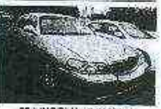
05 LINCOLN - 84K Miles 1 Local Owner - $8,500 Pete's Auto 402 Oak St. - Seneca 962-1467