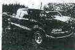
02 CHEVY S-10 179K Miles - $5,900 Pete's Auto 402 Oak St. - Seneca 892-1467