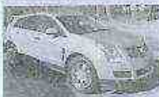
2010 Cadillac SRX Luxury, 45K miles, $16,500. Pete's Auto 402 S. Oak St. - Seneca Call 882-1467