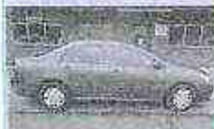
2010 Toyota Corolla 87,995, 123K Seneca Auto Sales 542 W.N. First St. Seneca, SC Call 864-888-7100