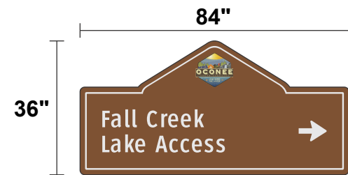
Sign Type 3.B

Sign Type Heights Can Vary to Accommodate Amount of Copy