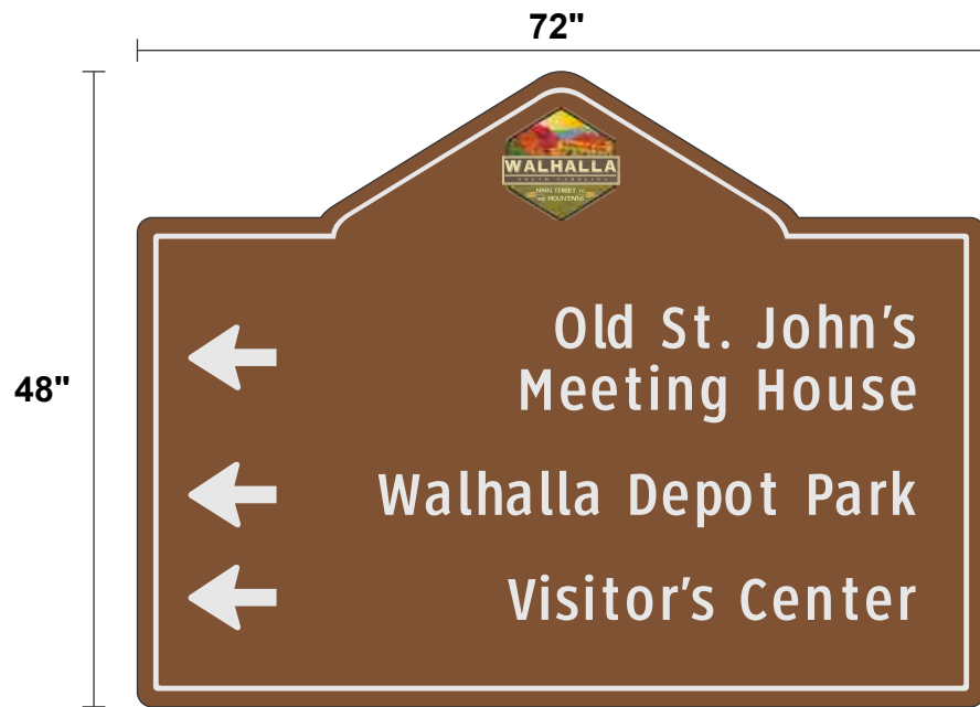
Sign Type 4