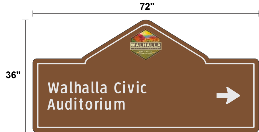
Sign Type 4.A