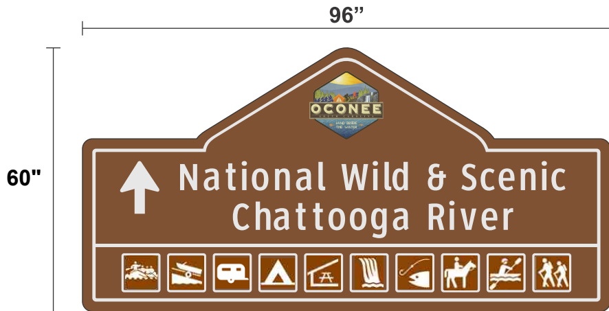
Sign Type 2